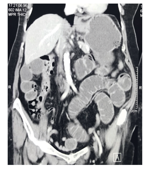
FIGURE 1: CT scan of the abdomen showing intestinal obstruction caused by Meckel's diverticulum.