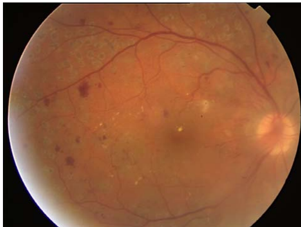
FIGURE 1. The scars produced by the impact of laser photocoagulation appear as grey retinal round marks surrounding the temporal vascular arcades. Multiple dot and blot hemorrhages and microaneurysms can be seen in the posterior pole. There are two types of white abnormalities: multiple lipid exudate deposition near the macula and a couple of cotton-wool spots temporal to the optic disk. An abnormal tissue emerges from the optic nerve head as well as new vessels, which cannot be properly seen because of hemovitreous.