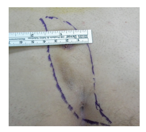
FIGURE 1: Margins for S-shaped oblique excision including the pilonidal sinus.