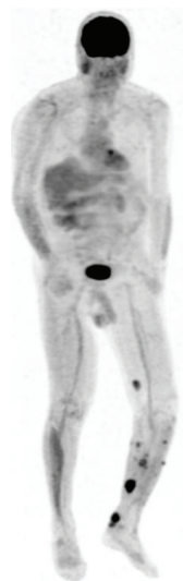
FIGURE 1: PET scan obtained to evaluate and stage the extent of histologically confirmed local recurrence of left lower leg soft tissue sarcoma.

investigating potential local recurrence [18] (Figure 1). In a recent publication evaluating the diagnostic and prognostic value of the PET/CT in sarcoma, it was found that the test is highly sensitive and specific in the detection of high-grade bone and soft tissue sarcoma but had a low positive predictive value for evaluation of nodal metastases [19]. Furthermore, it was found that the SUVmax of the primary tumor was a strong predictor of survival [19].