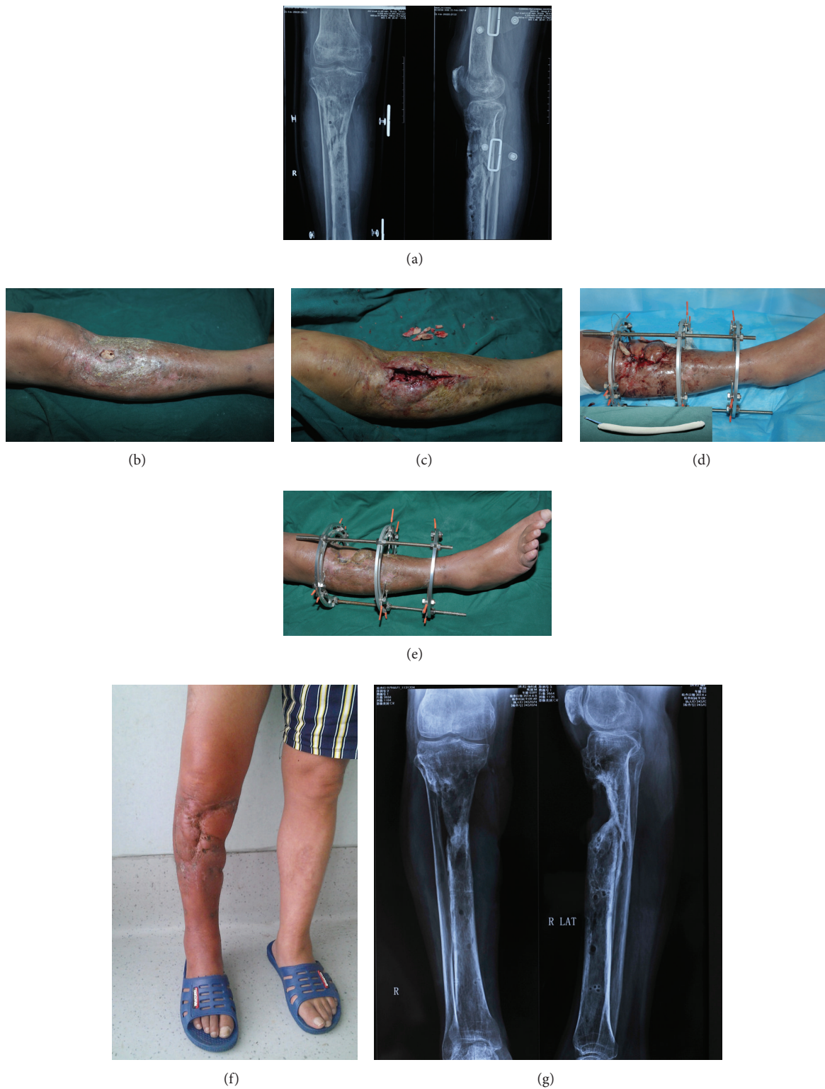
FIGURE 2: A 35-year-old male with a proximal diaphyseal fracture had received a plate fixation and later was removed due to IRI (a). A sinus existed in the proximal tibia and the bone was exposed (b). During the debridement, all the dead bones were removed (c). The wound was closed with the medial gastrocnemius flap and vancomycin cement rod in site (d). Two months later, the wound healed (e). At two-year follow-up, the wound and the bone healed well. The patient could walk normally ((f), (g)).